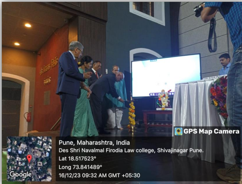
Lighting of the lamp by Dignitaries